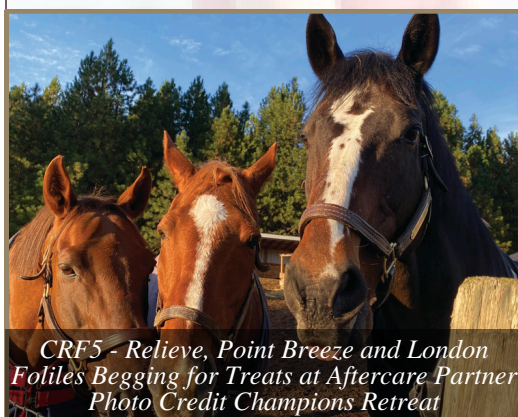
CRF5 - Relieve, Point Breeze and London Foliles Begging for Treats at Aftercare Partner