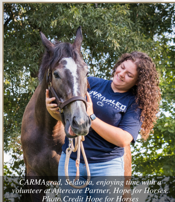
CARMAgrad, Seldovia, enjoying time with a volunteer at Aftercare Partner, Hope for Horses.

Get the new year off to a good start with a tax-deductible donation to CARMA. It's good karma for 2025! You can do so by clicking here .